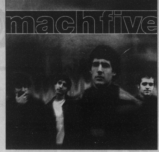
With four songs of high quality, Mach Five has managed to release a CD that keeps them from being a potential flash in the pan.

Athenaeum jumps out of college scene into national air play