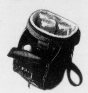
Golf Pack Cooler keeps food and drinks cold for hours. ($30)