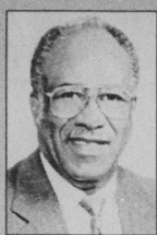
SEN. HOWARD LEE D-Orange

"We can see this as a good beginning, but it will not be all we have to do. The Legislature will have to step up and do its part."