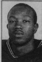
Former N.C. State All-American Torry Holt caught seven passes for 109 yards and a TD in the Rams' win.

Louis 26 on a 32-yard screen pass from McNair to George. But Del Greco missed a 47-yard field goal. Warner then hit two quick passes, 32 yards to Torry Holt and 17 to Marshall Faulk. But that drive stalled at the 9, and Jeff Wilkins hit a 27-yard field goal to give St. Louis the lead. The Titans kept the Rams out of the end zone again after St. Louis drove 73