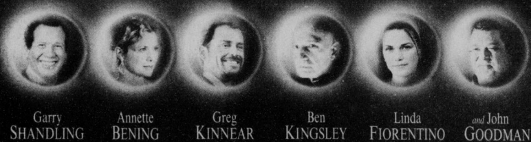
Garry SHANDLING Annette BENING Greg KINNEAR Ben KINGSLEY Linda FIORENTINO and John GOODMAN

COLUMBIA PICTURES PRESENTS A BRAD GREY/BERNIE BRILLSTEIN PRODUCTION "WHAT PLANET ARE YOU FROM?"