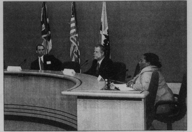
Candidates for Orange County Board of Education and Orange County Board of Commissioners positions participate in an election forum.

With a free-flowing question and answer format, the forum for school board candidates covered budget con-