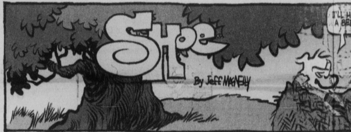
This was MacNelly's first drawing to appear in The Daily Tar Heel. It ran in the October 27, 1967 issue and promoted a men's soccer game that day.

THE TARHEEL BOOTERS TAKE ON A POWERFUL SOUTH FLORIDA SQUAD THAT HAS LOST ONLY ONE GAME THIS YEAR, 1-0 TO SOCCER POWERHOUSE, ST. LOUIS. -MACNELLY