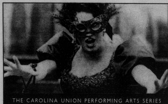
THE CAROLINA UNION PERFORMING ARTS SERIES

The Arts & Entertainment Editor can be reached at artsdesk@unc.edu .