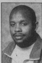
Former Tar Heel Freddie Jones caught five passes for 72 yards and one touchdown in San Diego's loss.

Mariano Rivera got the final five outs for his 16th post-season save, breaking the record he had shared with Dennis Eckersley since Friday night.