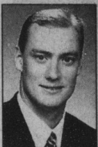
Panthers quarterback Chris Weinke has completed 30 of 54 passes for 350 yards during the preseason.

season, but was 15 for 27 for 115 yards with four interceptions in three games. He completed just 6 of 11 for 19 yards and threw three interceptions in a span of four passes in a 20-17 victory against the Ravens on Thursday night in Baltimore.