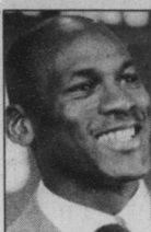
Former UNC guard Michael Jordan has captured six NBA titles and scored 29,277 points in his career.