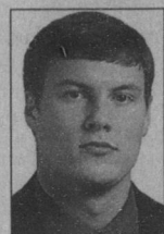
N.C. State QB Philip Rivers has thrown for 1,481 yards and 13 touchdown passes through six games.