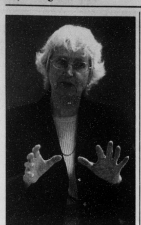
N.C. Sen. Ellie Kinnaird speaks

Monday night to UNC's Young Democrats about pushing a death penalty moratorium in the Senate.