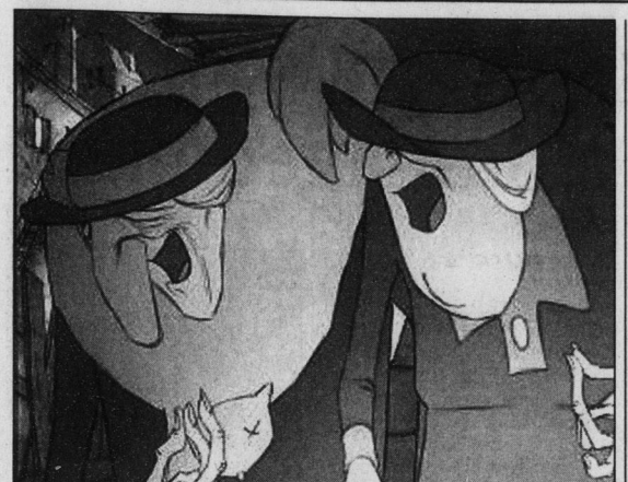
Two-thirds of the jazzy geriatric trio in 'The Triplets of Belleville' croon