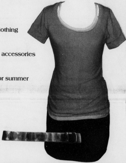
C&C pink t-shirt - C&C yellow tank - Paper Denim Cloth mini skirt - Wink belt

Chapel Hill 452 W. Franklin St. (919) 933-4007 Raleigh 450 Daniels St. (919) 852-1234 www.uniquities.com