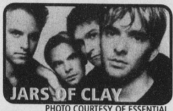
JARS OF CLAY

Christian rock music is sweeping the nation, garnering sales and touching lives. But the trend is complex. Despite its popularity, the holy genre has come under fire from some groups.