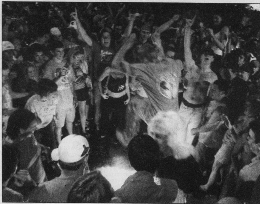
Tar Heel fans celebrate the men's basketball team's victory in the crowning game of the NCAA Tournament. About 45,000 people packed six blocks downtown in the wake of the team's 75-70 victory against Illinois.

Eight minutes after, police began clearing the street, and a short time later, what might be remembered as the greatest post-game jubilee in Tar Heel history was over.