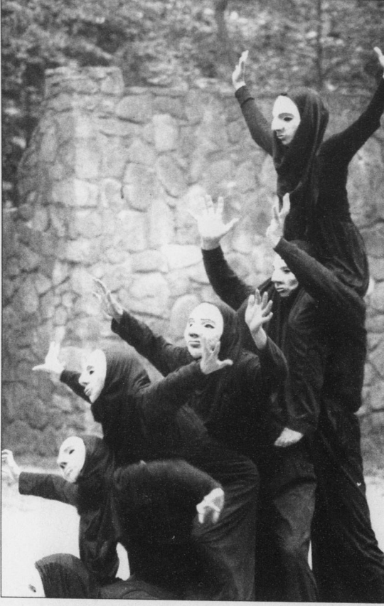
A group of performers dance at the Forest Theatre Saturday night during the Paperhand Puppet Intervention's show called "Garden of the Wild."

was burglarized twice last weekend, according to a press release from the Chapel Hill Police Department.