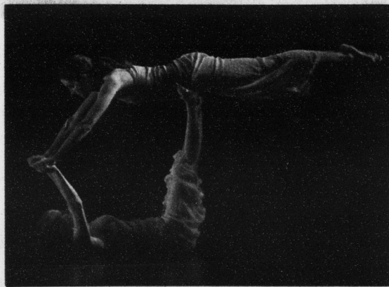
Student dancers perform to the piece, "You Are (You Are Wherever Your Thoughts Are)" during the Modernextension performance Thursday.

THE UNC WOMEN PLAY GWU AT 9:30 P.M. SUNDAY. CHECK ONLINE SATURDAY FOR A PREVIEW.