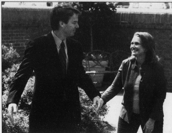
Presidential candidate John Edwards and his wife, Elizabeth, host a press conference at the Carolina Inn to tell the public that her cancer has returned but that the campaign will go on.

The recurrence was first detected last week after she experienced pain in her