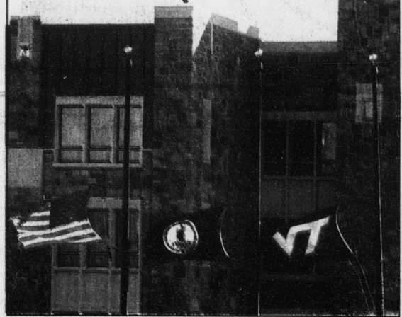
Flags were lowered to half-staff outside the Alumni Center at Virginia Tech on Monday afternoon to mourn those killed earlier in the day.