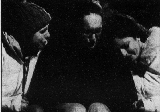
Students mourn at a vigil held Monday night at the War Memorial Chapel near Norris Hall, where shootings took place earlier in the day.