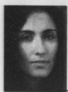
Singer Haale is the frontwoman of a rock band of the same name. Poetry influenced some of the songs.

Today's show won't be the first time Haale has performed in Chapel