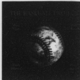
MUSIC REVIEW THE BASEBALL PROJECT VOL. 1: FROZEN ROPES AND DYING QUAILS ROCK

Frozen Ropes and Dying Quails is an interesting look at the intricacies of the game's history, from the oft-overlooked Curt Flood — the game's first free agent — to the even more oft-overlooked Harvey Haddix — threw 12 perfect innings for the Pirates in 1959 — and it mostly takes the back roads to Cooperstown.