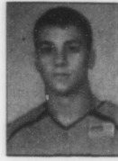
UNC All-American forward Tyler Hansbrough is nominated for best college male athlete.

Though Hansbrough might be sticking around for the title, fellow ESPY nominee and Kansas State freshman phenom Michael Beasley was drafted No. 2 overall by the Miami Heat in June. Beasley finished third in season scoring with 26.2 points per game and first in