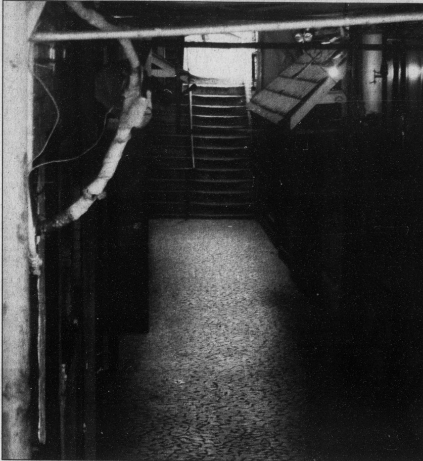
Though Amber Alley is a convenient cut-through between Rosemary and Franklin streets and provides quick access to the Rosemary St. parking deck, many users find its dark, damp atmosphere disconcerting.