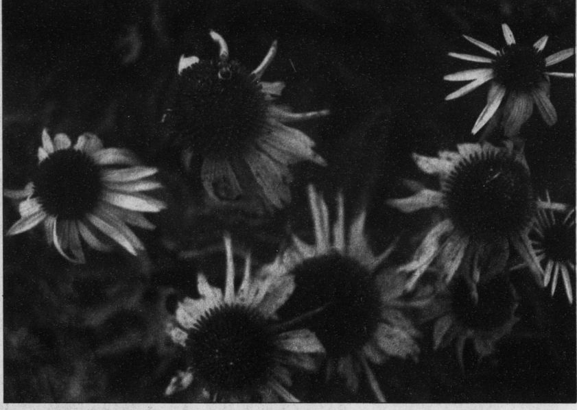
Echinacea flowers serve as a food source for a honeybees, whose population has declined during the past year. Edible Earthscape Farm sells their flowers every Saturday morning at North Hills mall in Raleigh.