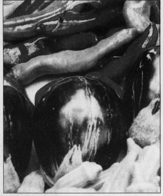
Jalapeno peppers, eggplants and okra are some of the produce grown at the family-run, 26-acre Dew Dance Farm in Moncure.