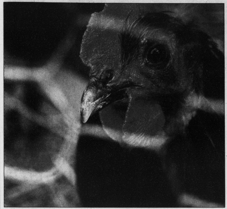
A rooster looks out from his coop at Edible Earthscape Farm in Moncure. The farm also produces 700 gallons of biodiesel a week made of refined oil collected from local colleges, high schools and businesses.

DTH ONLINE: View a slideshow with more photos from the farm tour.