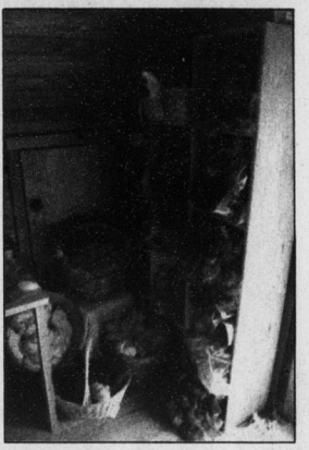
Wool produced from rare breeds of sheep on the Dew Dance Farm in Moncure is used to knit baby booties. There are four breeds of sheep used for the wool.