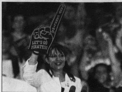
Republican vice presidential candidate, Sarah Palin, thanks the crowd at a rally at East Carolina University on Tuesday.