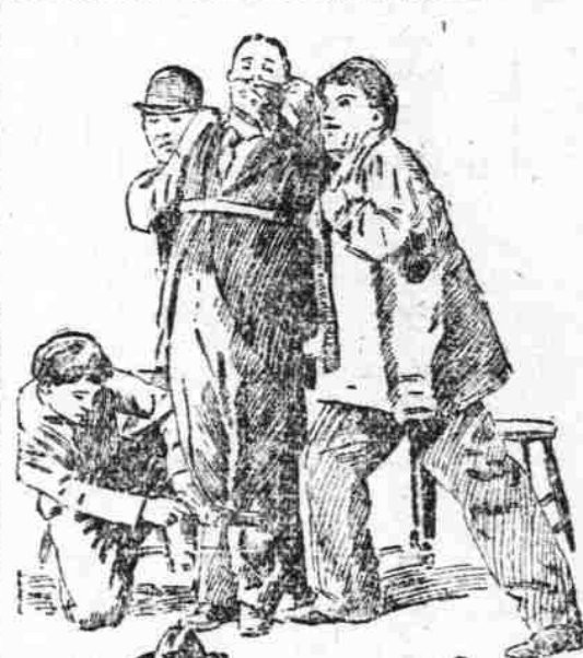
THE PLOTTERS AT WORK.