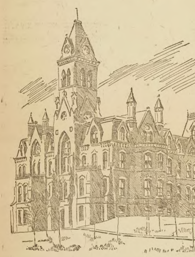
UNIVERSITY OF PENNSYLVANIA.

The making of leather belting is a distinct industry, but one which might very consistently be included in a general article on the leather industry.