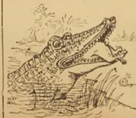
DON'T BE TAKEN IN.

Correspondence solicited. Office, Room 2, over MacRae's Branch Pharmacy.