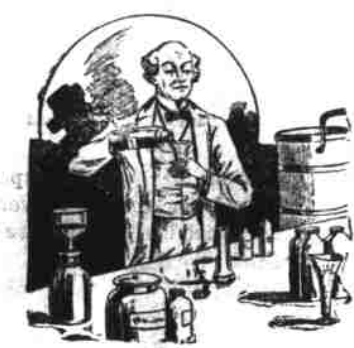
Simpson's Eczema Ointment cures all Skin Diseases.