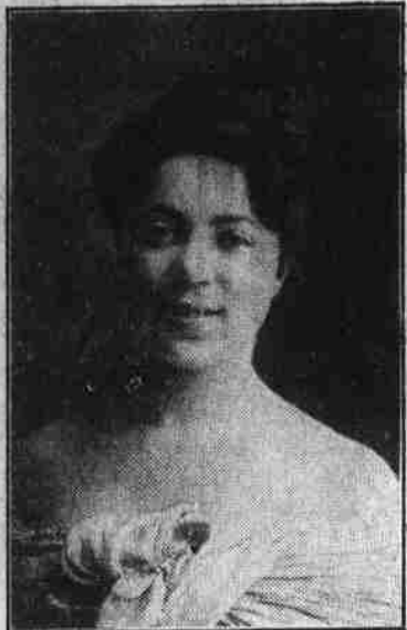
Finnegan's Ball Company.

"Finnegan's Ball." The real musical comedy success will be presented here tonight at the Academy. This clever comedy which has been re-written and brought up to date is the season's greatest success. It played four months in New York city at the 14th Street Theatre. It is composed of