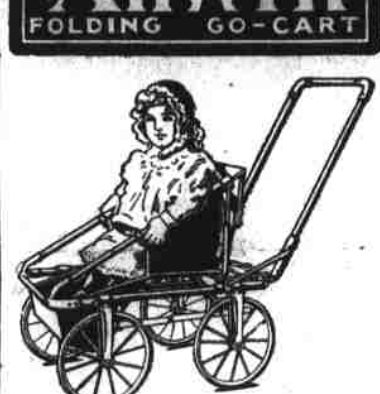
UPRIGHT, IN USE,