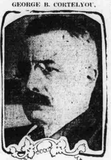
GEORGE B. CORTELYOU, Secretary of the Treasury, who will almost certainly be named for vice-president.