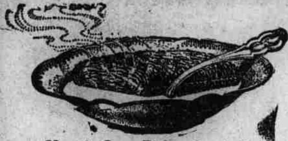
Heat in Oven Before Serving.

A GOOD BREAKFAST FOR FIVE CENTS. Start the day right by eating a breakfast that gives the greatest amount of mental and physical strength with the least tax upon the digestion. Two