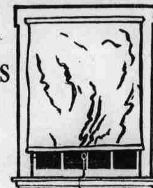
Weather-Proof Shade. Ordinary Shade. See the Difference.

Weather-Proof Shades wear longer than ordinary shades, won't crack or fade like Holland Shades. Ordinary Shades are filled with chalk to make them opaque. Weather-Proof Shade materials are made without filling of any kind, and won't wrinkle or sag.