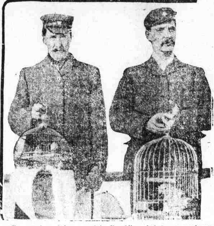
Two members of the crew of the Republic and their pet canaries and parrot which they rescued

61. Name the provisional or ancillary culosis. emedies provided in the Code of Civil Procedure.