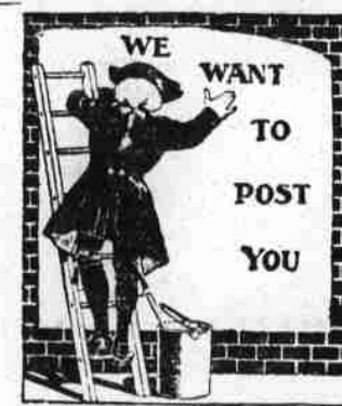
H. MAHLER'S SONS,

Royall & Borden Furniture Co., 127 Fayetteville St. -- Raleigh, N. C