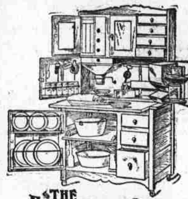
THE HOOSIER KITCHEN CABINET Copyrighted, 1906, by Hoosier Mfg. Co.

We are showing the Hoosier Kitchen Cabinet, Sanitary Tables, and Steel Ranges.