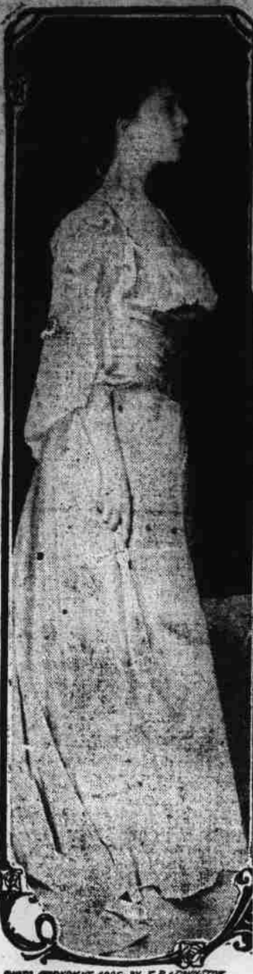
Mrs. Alice Longworth, wife of Congressman Nicholas Longworth, who was recently the subject of a lively discussion of club women of Pittsburg because she is alleged to smoke cigarettes. After a spirited discussion by a number of women, a prominent daughter of the American Revolution arose and said: "We needn't all get our feathers up simply because Mrs. Longworth smokes cigarettes. Why, one hundred years ago our great grandmothers sat with their husbands and smoked corn-cob pipes.

Cures eczema or money back. Just breathe in. Complete outfit, including inhaler & atomizer 60c. Druggists.