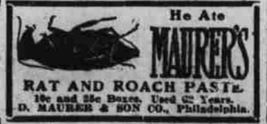
RAT AND ROACH PASTE. He Ate MAURE'S. RAT AND ROACH PASTE. 10c and 25c Boxes. Used 25 Years. D. MAURE & SON CO., Philadelphia.