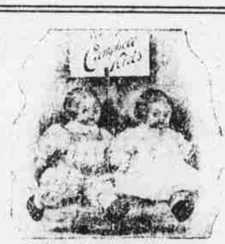
Call and See Us. We are at "TOYLAND."

"If a man takes his meat in hi ingers, he can pick it with more rel ish," the other doctor said "CHI dren, whose instincts are often very sound, love to eat their food in their