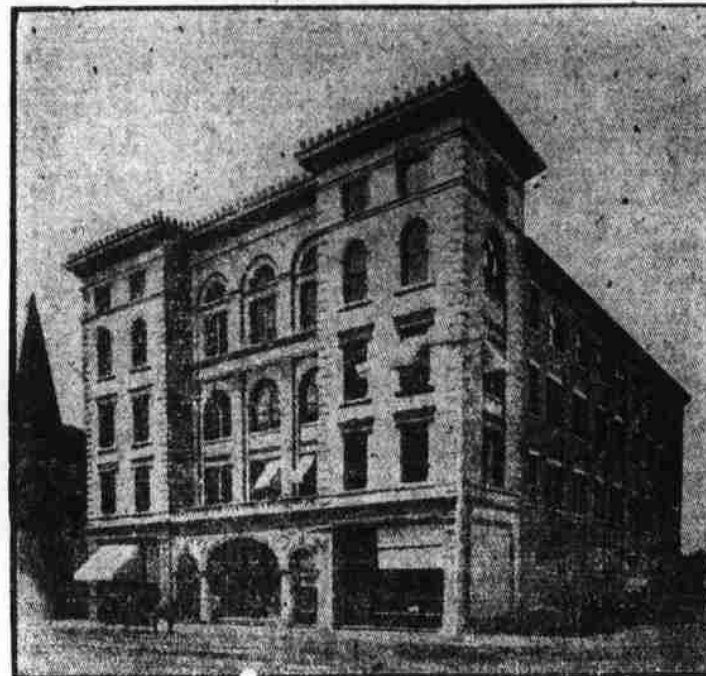
PIEDMONT BUILDING IN WHICH KING'S BUSINESS COLLEGE, CHARLOTTE, N. C., IS LOCATED.

KING'S BUSINESS COLLEGE RALEIGH, N. C. or CHARLOTTE, N. C.