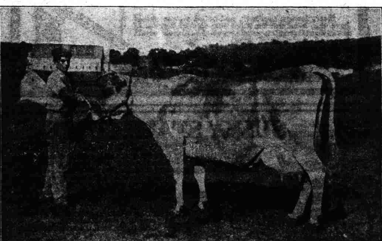
ANYONE COULD BE PROUD OF THIS COW.