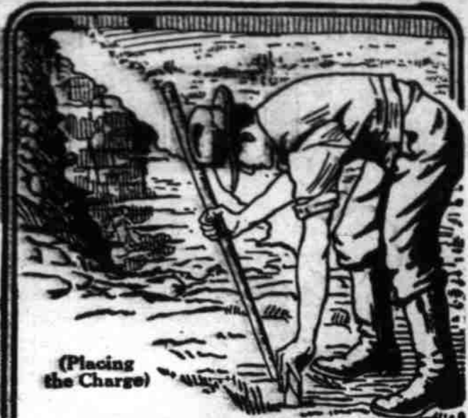
(Placing the Charge)