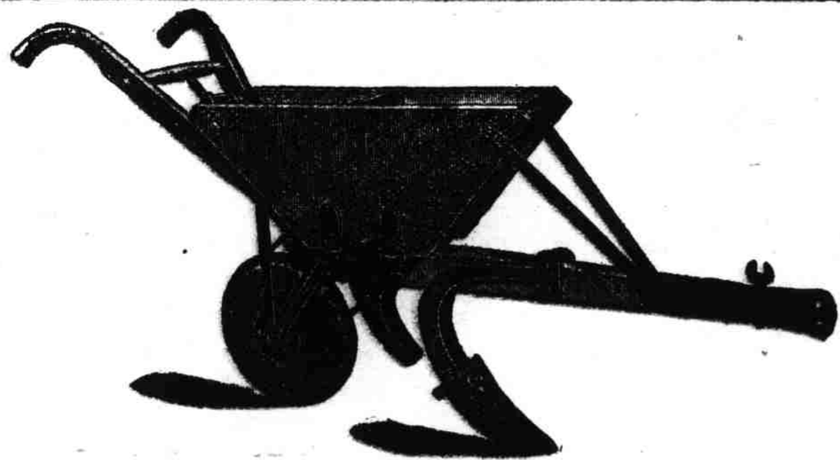
"The Hooks do the Trick"