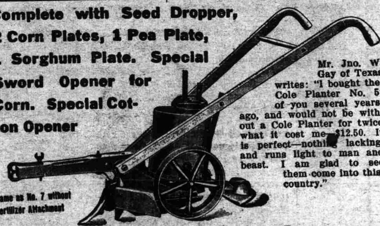
Same as No. 7 without Fertilizer Attachment

Complete with Seed Dropper, 2 Corn Plates, 1 Pea Plate, 1 Sorghum Plate. Special Sword Opener for Corn. Special Cotton Opener