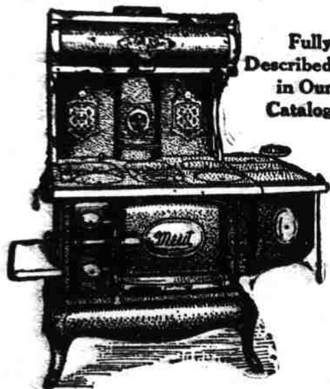
Fully Described in Our Catalog

The tops are cut in four pieces to prevent cracking and warping. The fire boxes are large and so constructed that ashes cannot accumulate. Duplex grates, or Flat Dumping or Shaking Grates. Heavy fire backs in three sections. Deep, large ash pits with ash chutes, which force ashes to the pan. Sheet flue construction insures strong drawing. Direct draft dampers operated from top, easily removed. Water front of good capacity and fire surface.