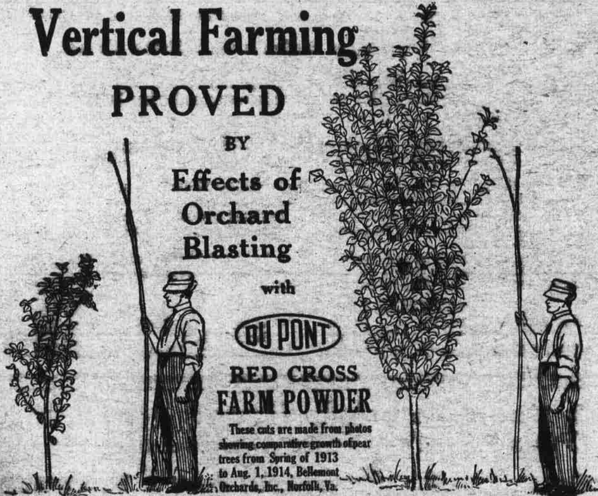
IN DUG HOLE

These cuts are made from photos showing comparative growth of pear trees from Spring of 1913 to Aug. 1, 1914, Bellemont Orchards, Inc., Norfolk, Va.