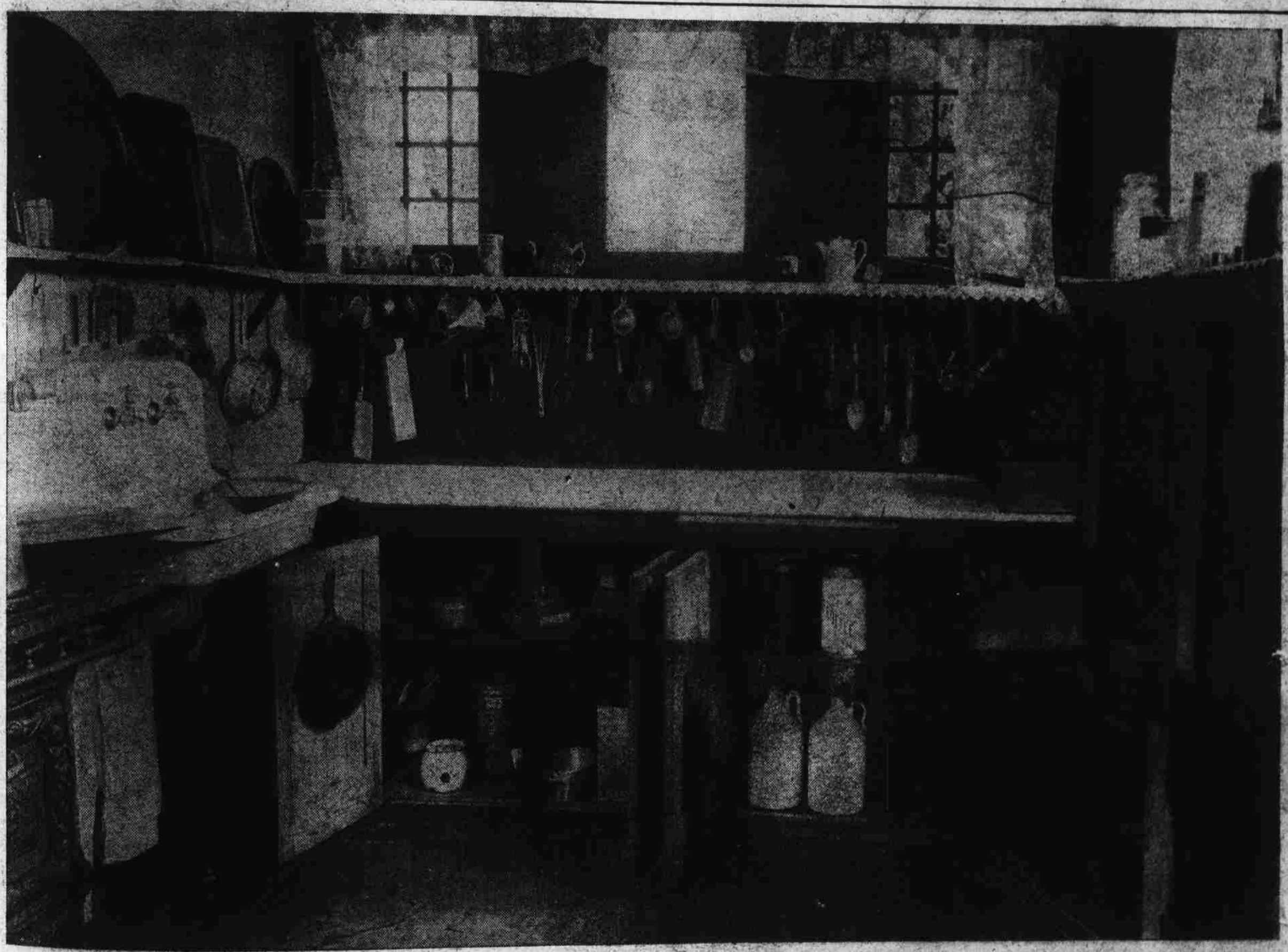
A CONVENIENTLY ARRANGED KITCHEN—MRS. HUTT'S (SEE ARTICLE ON PAGE 14)

about it is that the cost of properly equipping the kitchen is so very little as compared with the cost of properly equipping the farm. A good range will not cost much—unless you buy it from a traveling agent—