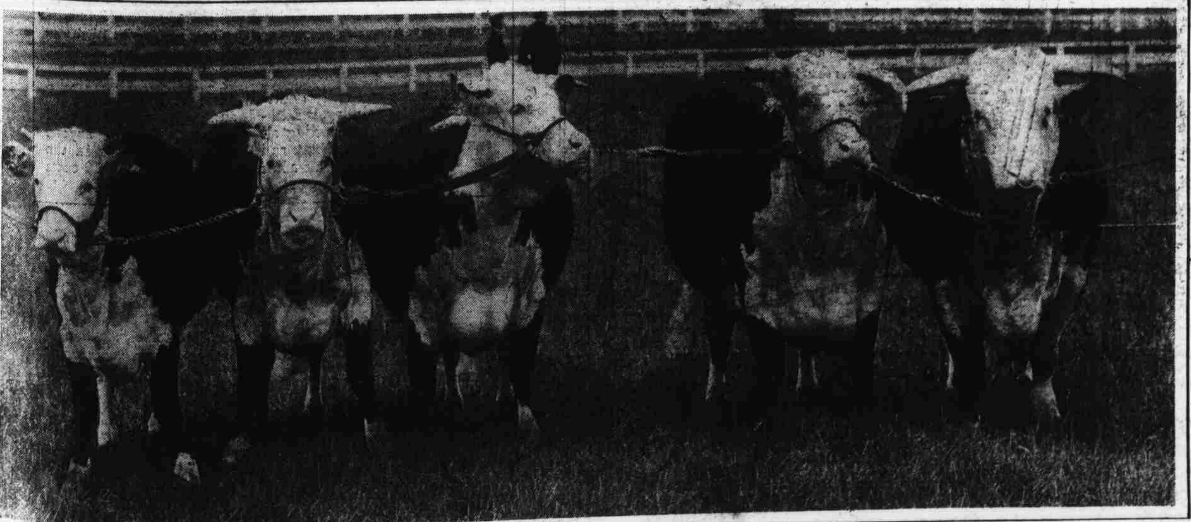
A GROUP OF PRIZE-WINNING HEREFORDS