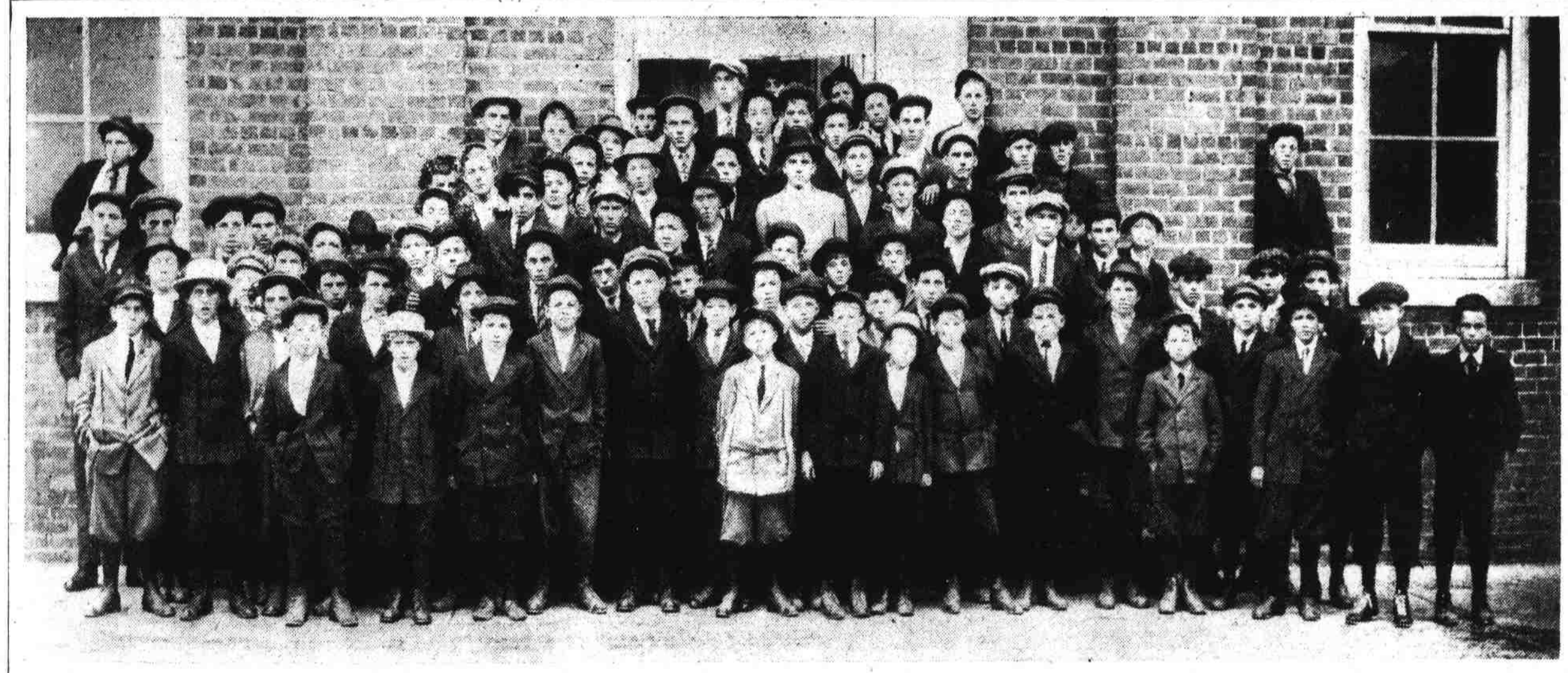
EIGHTY-SEVEN STANLY COUNTY, N. C., CORN CLUB BOYS ASSEMBLED FOR INSTRUCTIONS

bership in these clubs. With a county farm demonstration agent in practically every agricultural county in the South, every farm boy in the South should be a member of the corn club or the pig club; and with canning club agents in some two or three hundred counties, every farm girl in these counties should interest herself in canning, poultry or other club work that will help her in learning to become a better homemaker. Now about the prizes: Of course the biggest prize of all, the prize of increased knowledge, the prize of learning how to do things better, more effectively, is a prize that can be won by every boy and girl. It is this big prize that we hope you will never lose sight of; but to make the club work still more attractive The Progressive Farmer has arranged a big list of valuable prizes that every Progressive Farmer boy and girl may compete for. This list of prizes will be announced in detail in an early issue of The Progressive Farmer. Then in addition there are