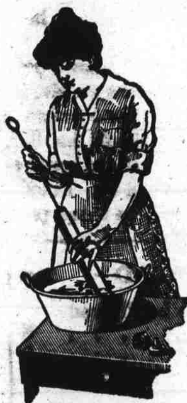
The bowl is easy to wash. There are only three parts, and no disk.

What this farm woman says in her letter is absolutely true. There are many other pieces of good news in our new book, "Velvet" for Dairywomen, which fully describes this wonderful separator. Send for your copy today. Address Dept. 121